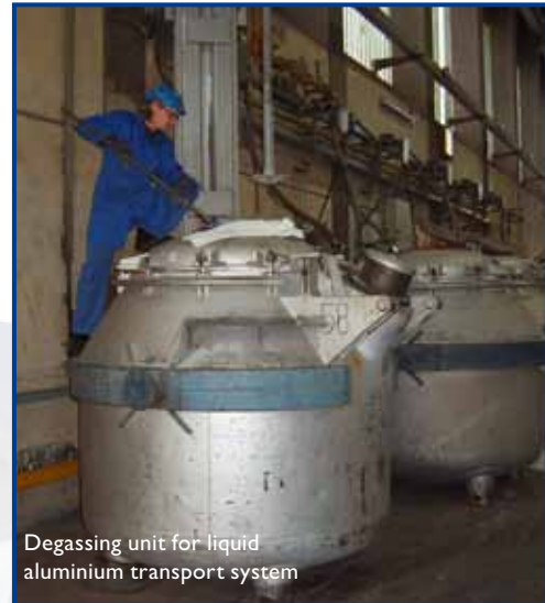
Degassing unit for liquid aluminium transport system

Additionally we offer services in sintering, hot-pressing and HIPing as well as in ceramic process engineering.