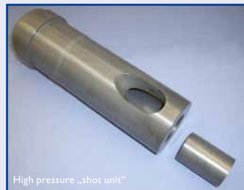
High pressure „shot unit“

Ask your questions about ceramics - we find solutions for you!